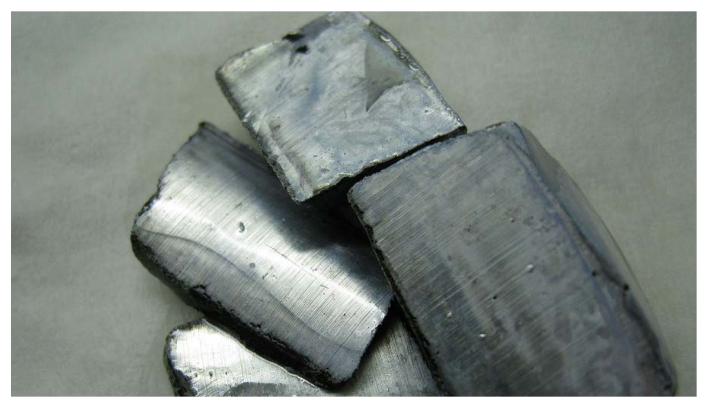
Lithium-ion batteries have a new rival – potassium metal batteries